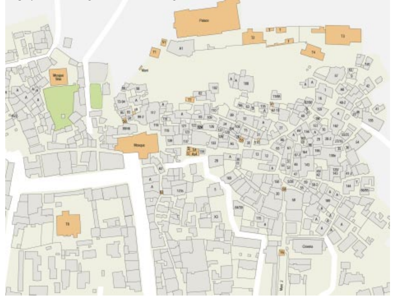
The 17th century royal palace towers above the historic part of the city