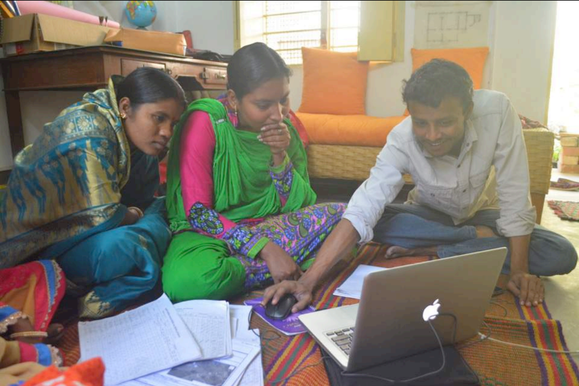
Working with technical team to create digital maps