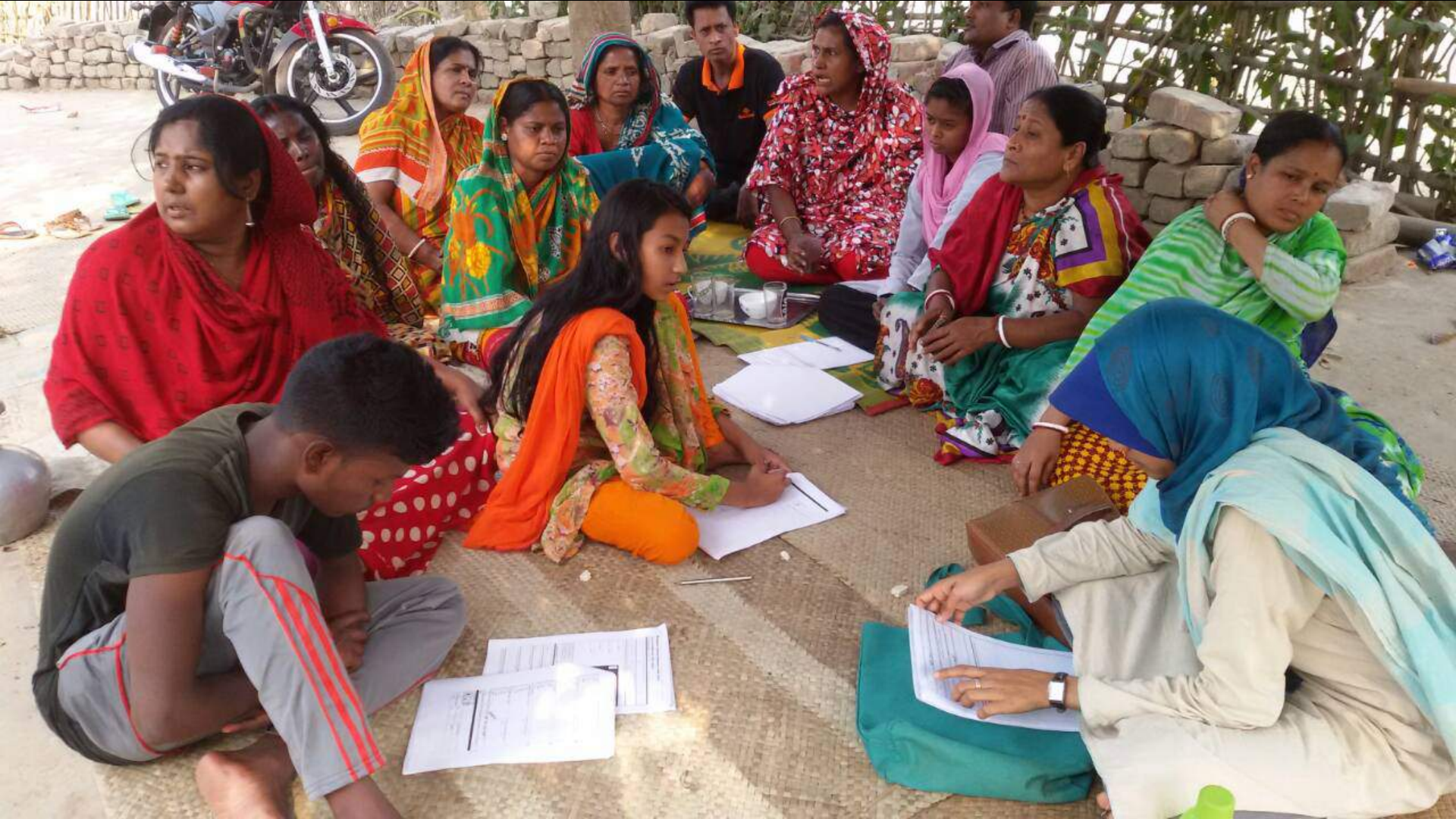
The technical team assisted in running the session at the very first community for easier understanding