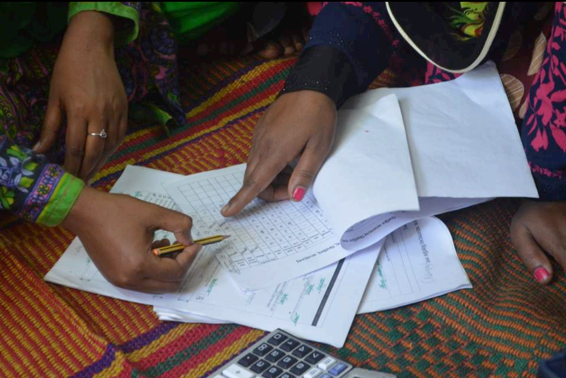
Counting and recounting, manually